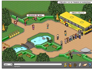
Habbo Hotel iv