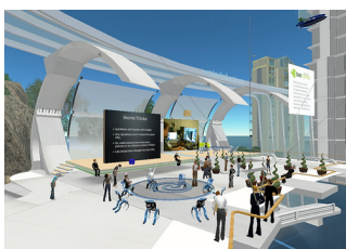
Second Life ii